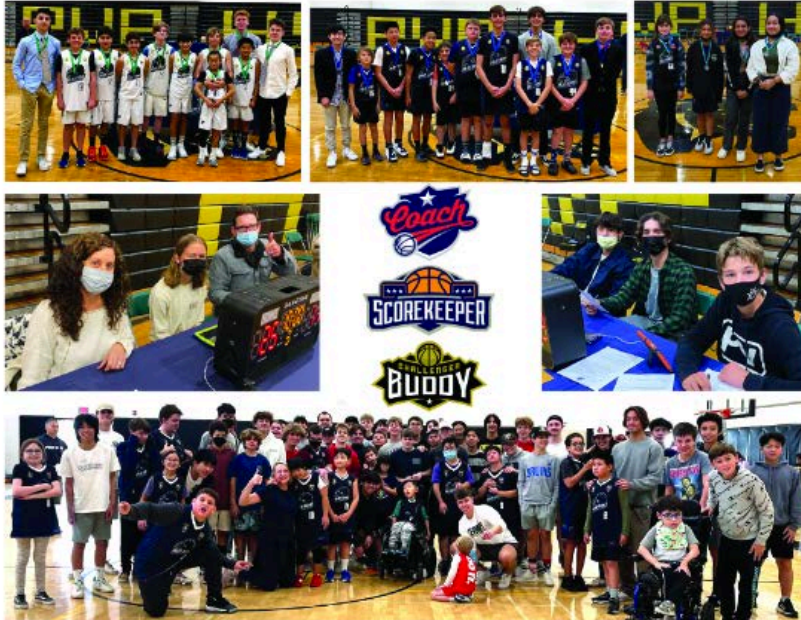
PVYBL is not related to, sponsored by, or endorsed by the Palos Verdes Peninsula Unified School District

Make a difference in the lives of 1,500 kids while earning volunteer hours! Season from December 7, 2024 to February 16, 2025 Mandatory training on Sunday, October 27, 2024 Visit PVYBL.com for details